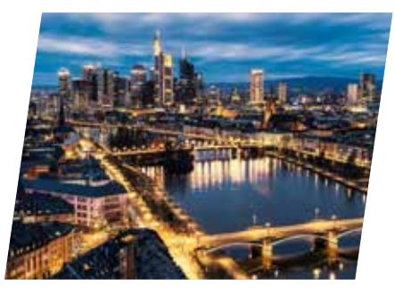
FRANKFURT – an international and diverse urban scene